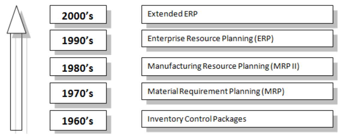
Fig.1 ERP Evolution